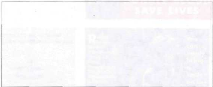
College NSS Banner